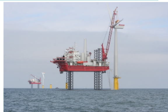
Seajacks-owned vessel Leviathan

Secure key player in the growth sector of offshore wind power with aim of expanding presence of Japanese companies in future